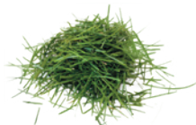
Grass clippings Use paper yard waste bags to prevent grass from sticking to your cart.