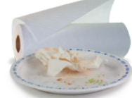
Food soiled paper • Paper plates • Paper towel • Napkins • Used tissues