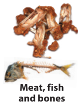
Meat, fish and bones