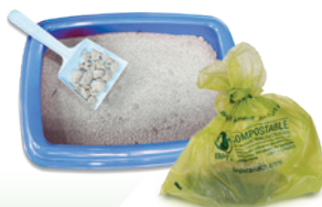
Pet waste and kitty litter (all varieties) Put in a certified compostable bag or paper bag and tie/roll closed.