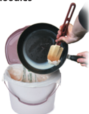
Cooking oil, sauces and grease

Tip: Use a paper towel to soak up any fats, oils or grease and put it in your green cart too.