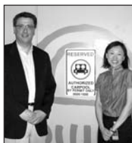
Blue Skies Alberta Health Services