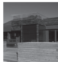
Educational Institution Alberta Solar Decathlon Team