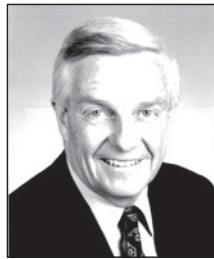
GRANT MACEWAN LIFETIME ACHIEVEMENT Peter Lougheed