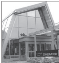
Not-for-Profit Calgary Zoo