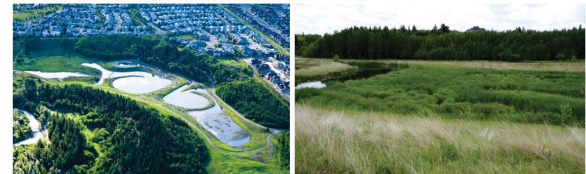
Marshall Springs Pond + Wetland, Fish Creek Provincial Park