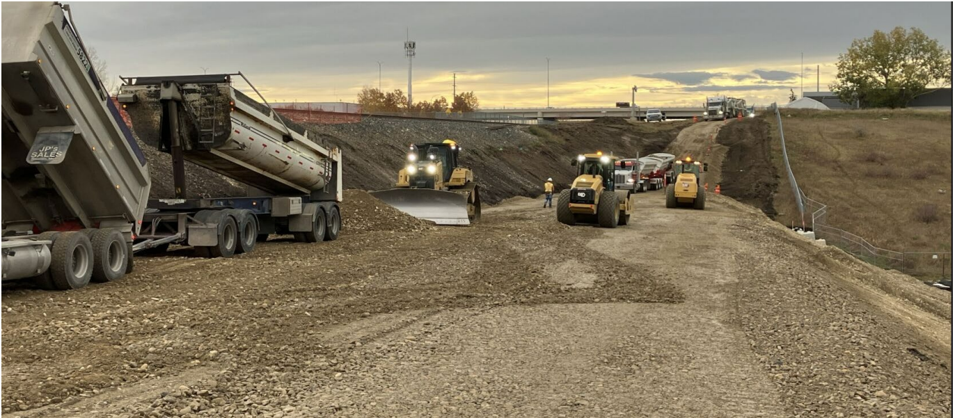
Looking south along the diversion track embankment.