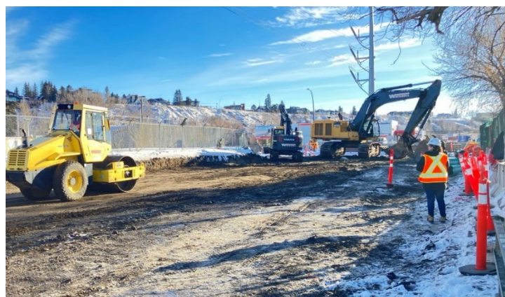
Feedermain removals on 6 Street S.E.

Utility relocations in Beltline and Downtown continued in January, with multiple third-party utility projects on downtown avenues, and ENMAX transmission work advancing in Beltline East. ENMAX construction also started work on 3 Street S.E. between 10 and 12 Avenue.