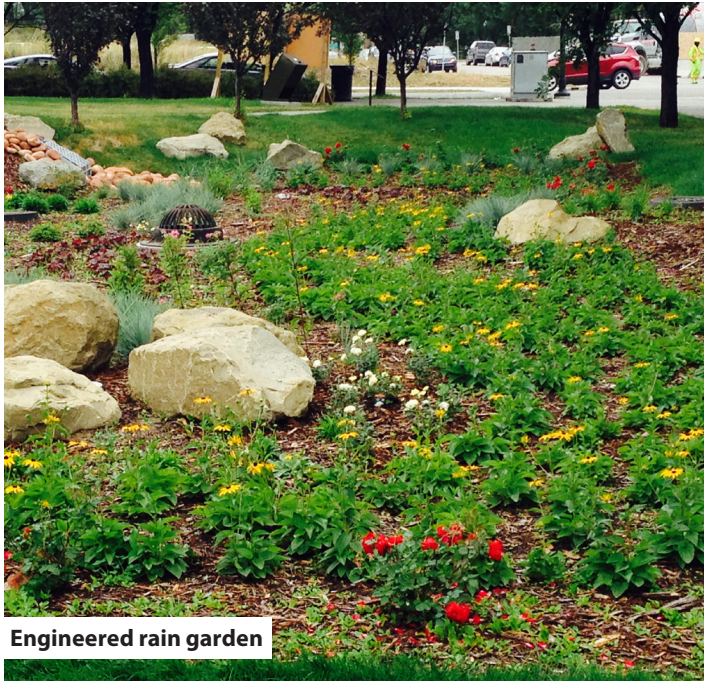
Engineered rain garden