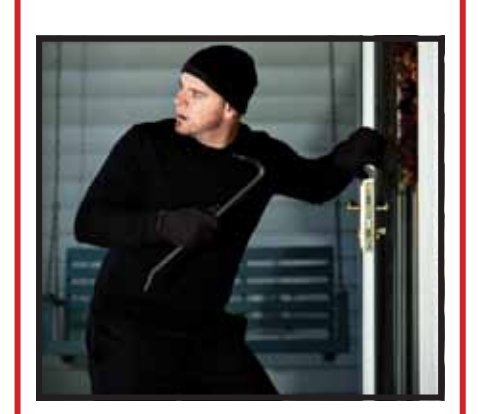
Phone the police 9-1-1.

"I think I see someone breaking into the house next door."