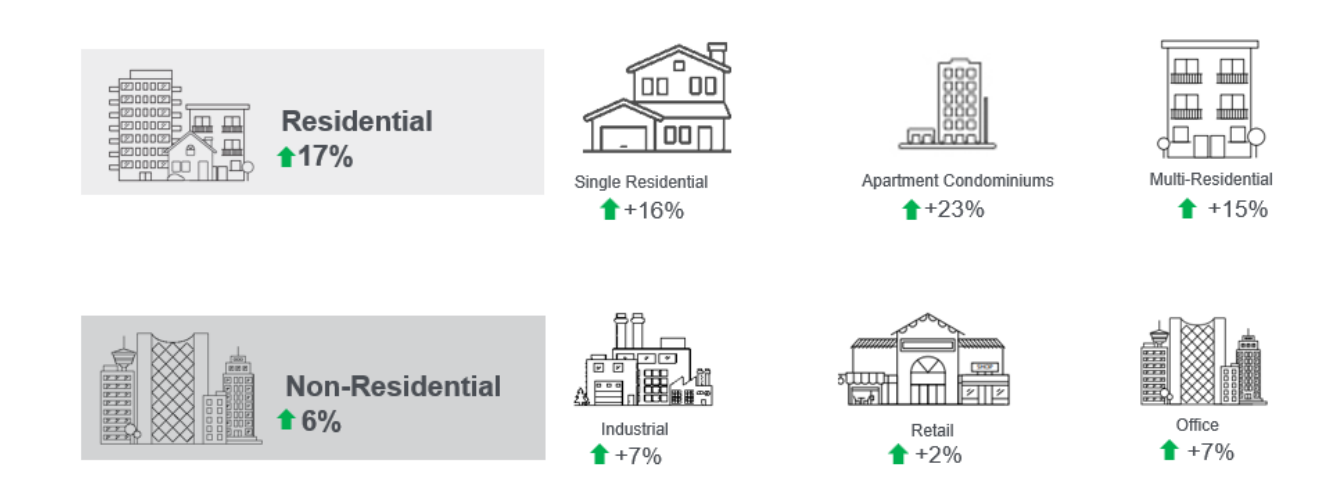
Note that these are preliminary values and are subject to change