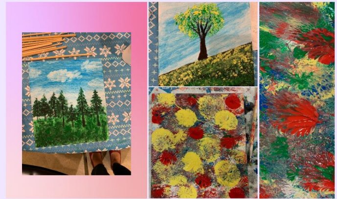
Neighbour Connectors PAINT NIGHT - December 2022