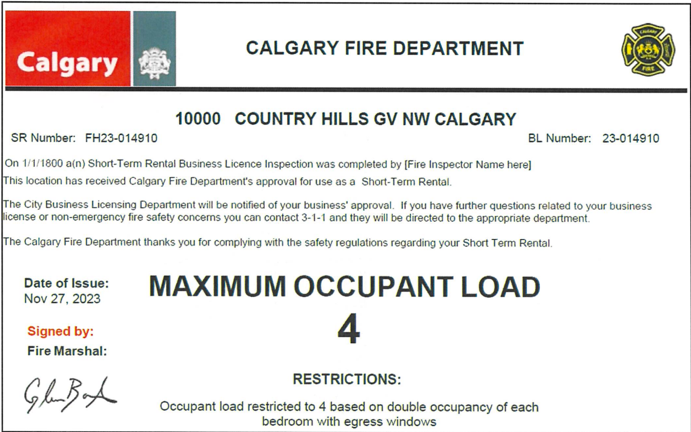
Figure 2 Sample Occupant Load Card (Issued after passing fire inspection)